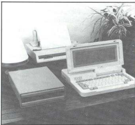
Desktop display of Standard C shipboard system.

Interested parties will gather at COMSAT this month to review the sea trial results. 🌐